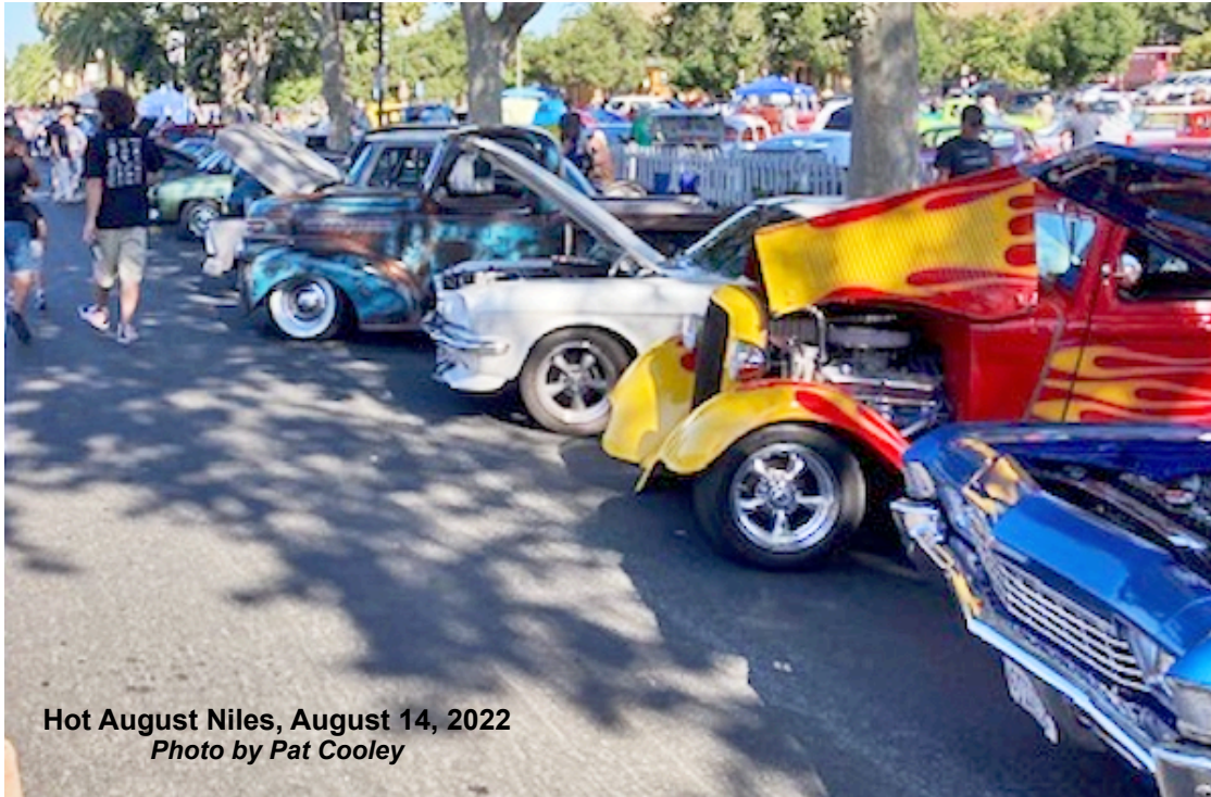
Hot August Niles, August 14, 2022