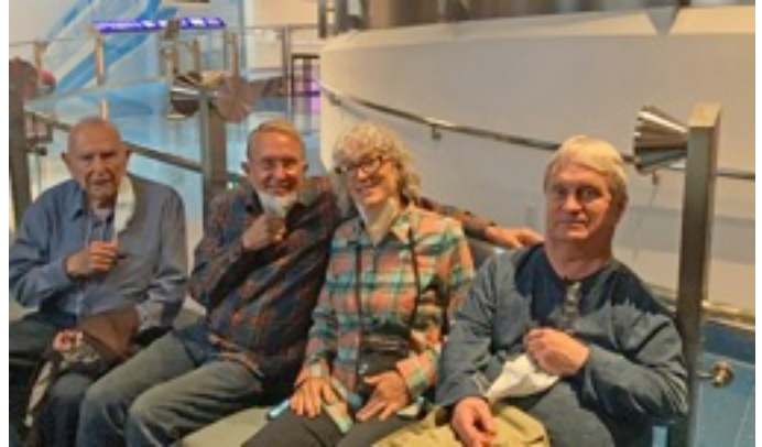
Above: Here is our group of tired Disney explorers.