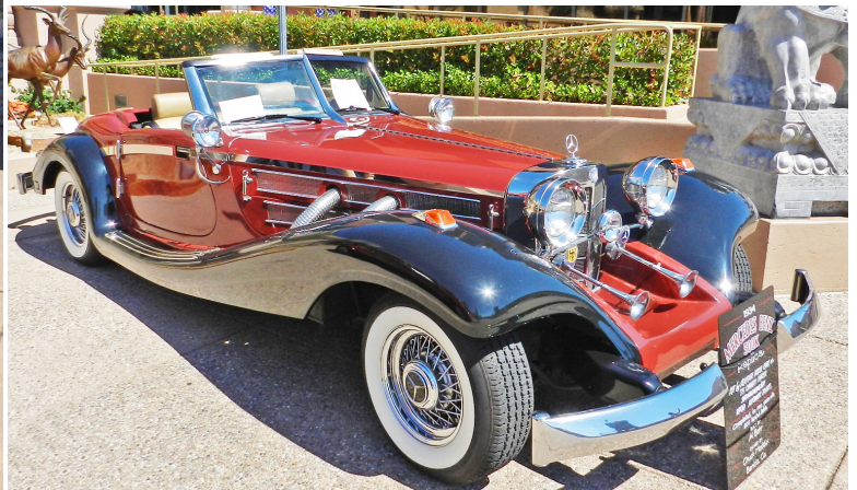
Chuck Maddux displayed his outstanding Mercedes 500K replica, powered by a Chevy 350 engine