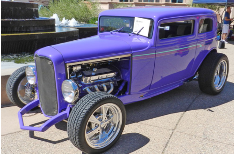
Dennis Ellis displayed this '32 Ford Vicky with GM 454 power and lots of gleaming chrome suspension parts