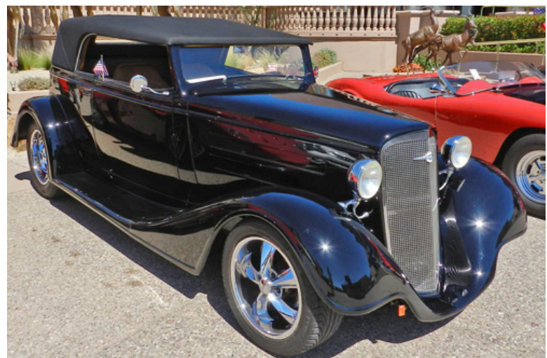
Chuck & Linda Hendsch brought their '34 Chevy Phaeton - Chevy 350 powered