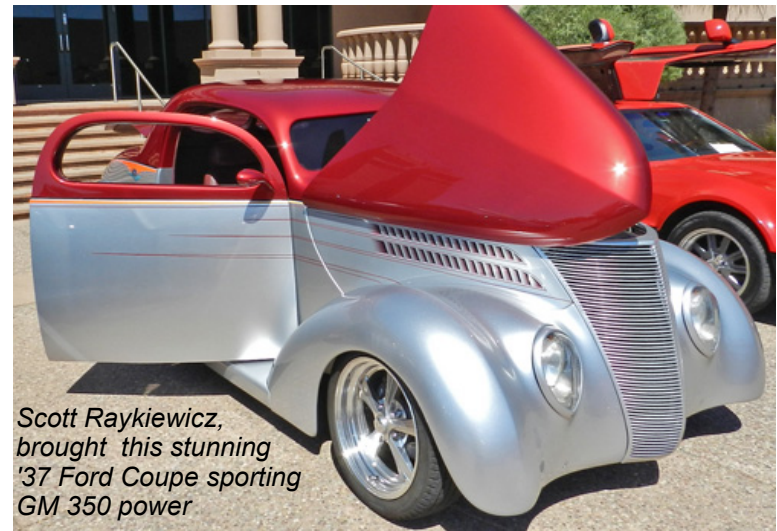
Scott Raykiewicz, brought this stunning '37 Ford Coupe sporting GM 350 power