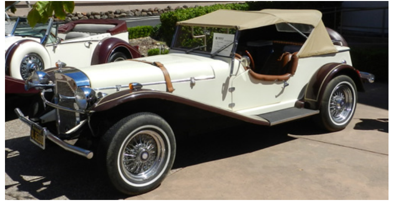
Al Bello's '28 Mercedes SSK replica powered by a Ford 2.3 L