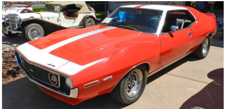
Gil Somerhalder's AMX Javelin has an AMC 401 V8 under