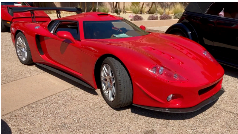
Scott Raykiewicz built this beautiful Factory Five GTM powered by a GM LS-3 engine