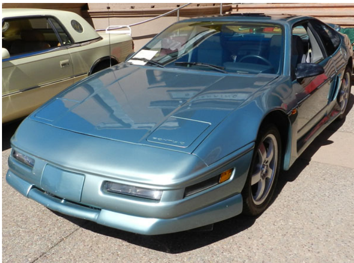
Below: Jim Wagner's Fiero based ZR-1