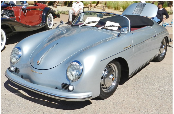
Below: Allen Howes' Porsche Speedster