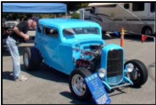
Show Chair Choice