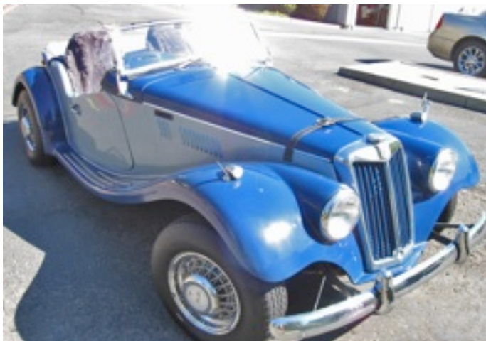
Terry Leavitt's MG - TF

Asking $6,500. Low miles. Contact Terry at 707-548-2434 or email terrillevitt@aol.com