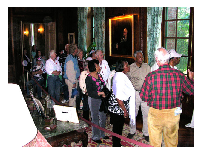
Above: Our group in the Drawing Room.