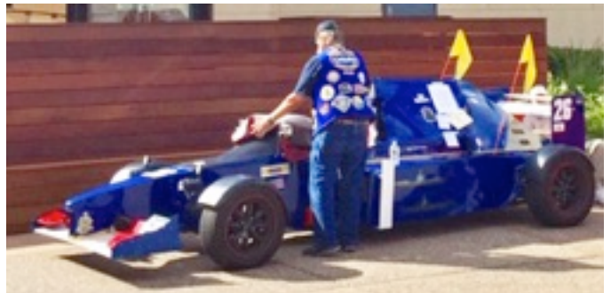
Shown above: Joe's Furor at its most recent show appearance.

Now, after some road testing, it's ready for the show circuit.