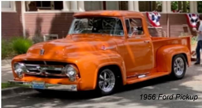
1956 Ford Pickup