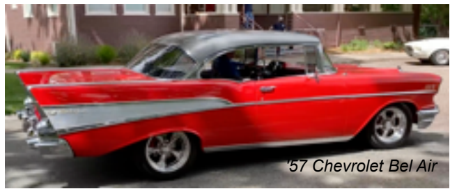
'57 Chevrolet Bel Air