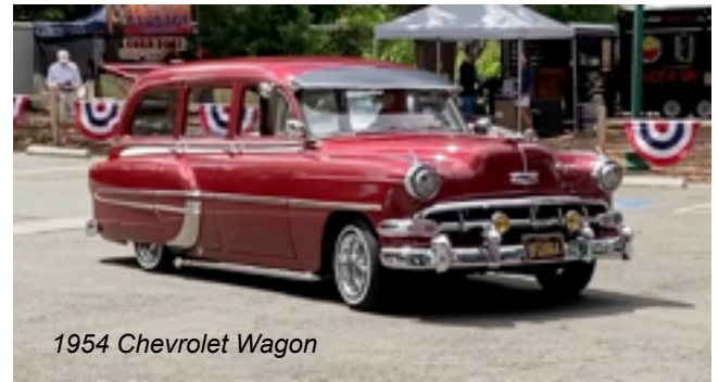
1954 Chevrolet Wagon