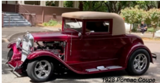
1928 Pontiac Coupe