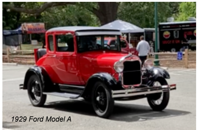
1929 Ford Model A

Here are some of the photos I caught at the end of the show at 3 p.m. I have tried to document the Year and Model for most.