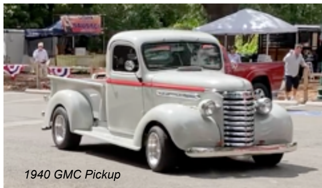
1940 GMC Pickup