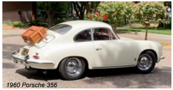
1960 Porsche 356