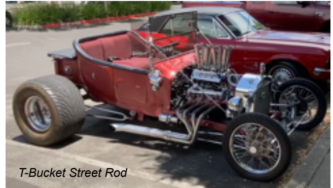
T-Bucket Street Rod