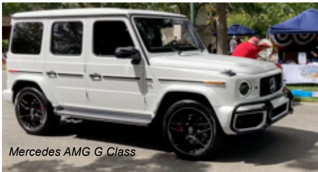
Mercedes AMG G Class