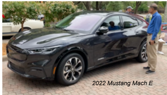
2022 Mustang Mach E