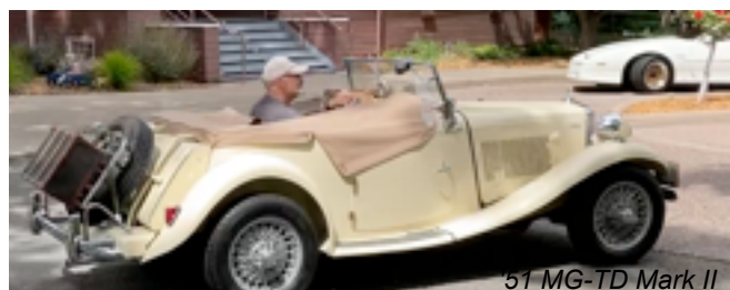
51 MG-TD Mark II