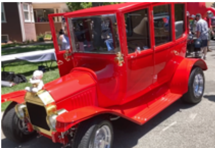
Model T Street Rod