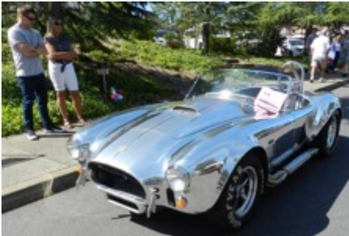
Above: Polished Aluminum Cobra