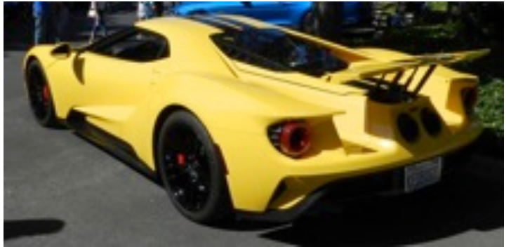
Above: New Ford GT