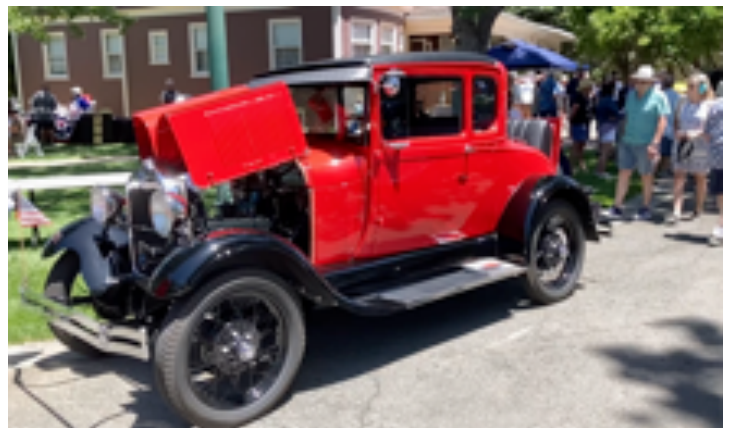
Above: '29 Ford Model A