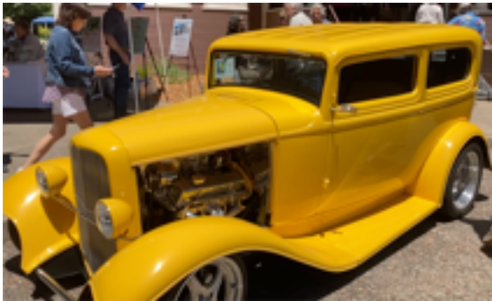
'32 Ford 2-door Street Rod