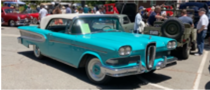
'58 Edsel Citation