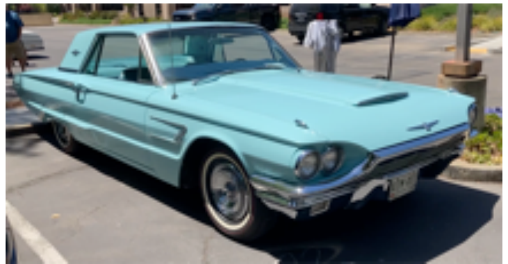
'65 Ford Thunderbird