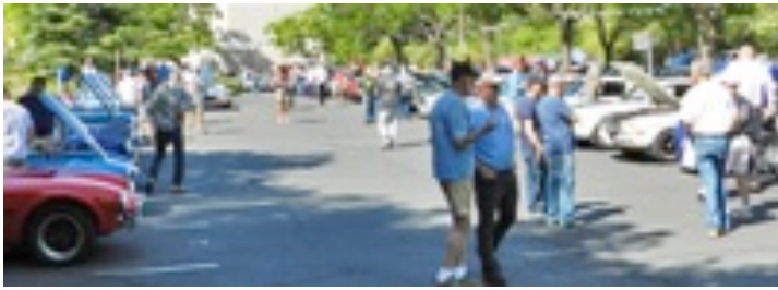
Above Left: Cobras