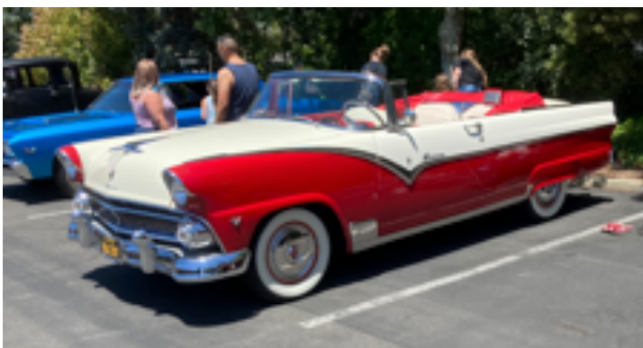
Below: '56 Ford Victoria Convertible