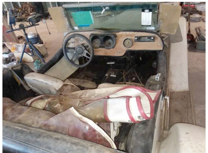
Gazelle with 2.0L Pinto engine