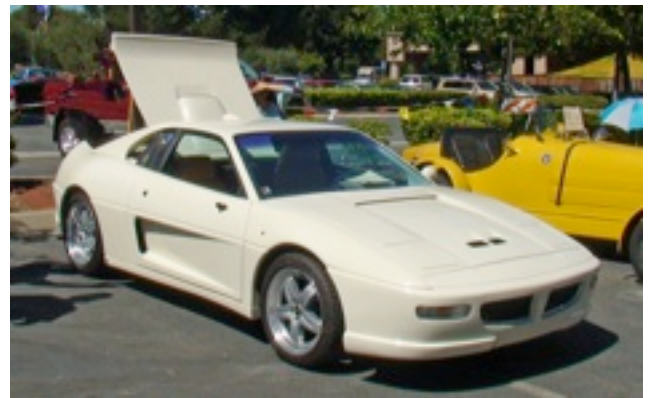
Al Bohr's Fino with Cadillac Northstar power