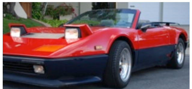
Al Clavalli - Ferrari 512bbi

1984 Ferrari 512bbi replica – Registered as a 1987 Pontiac, rebuilt Fiero V6 with 5-speed manual. Fiero parts are readily available and car is inexpensive to maintain, no problems with insurance or smog requirements. Amenities include: removable hardtop & tonneau cover(rare), Kenwood stereo, 4 wheel disk brakes, power windows, Performance AS R16 tires, chrome Ferrari wheels, Ferrari steering wheel, emblems, etc. Car always garaged, and covered in the garage. Firm price of only $8,500 is an excellent buy and good investment. For pictures or information e-mail: ferrari512.bbi321@yahoo.com