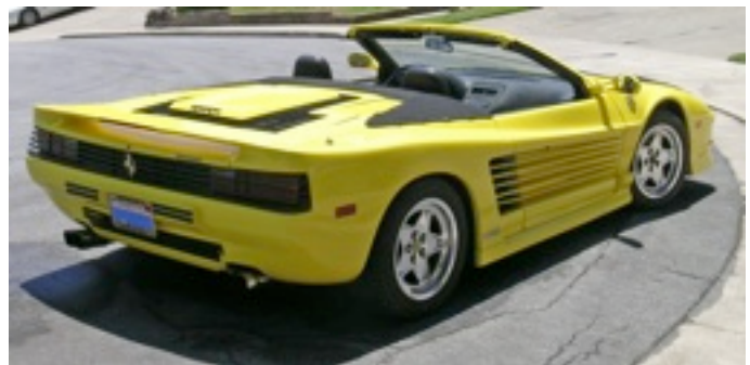
Al Clavelli's Ferrari Testarossa

FERRARI Testarossa (yellow). This beautiful and extremely well built smog exempt car won 7 awards including first place at Knott's and was featured in Kit Car Illustrated. The chassis is a lengthened Fiero, with a Chevrolet 327 engine, a Getrag 5-speed transmission, authentic Ferrari chrome-plated aluminum wheels, Eagle F-1 tires, plus many other amenities. This is my fourth replica and is by far the best. $21,500. Al Clavelli 650 573-8125 or e-mail alclavelli@aol.com . (7/11)