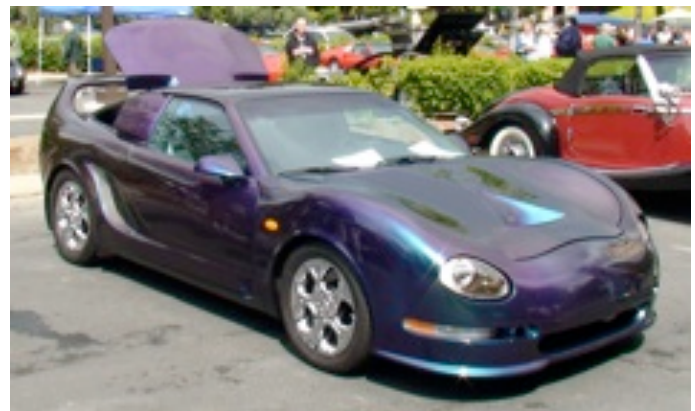
Al Bohr's Fino with Cadillac Northstar power

FINO – Built on 1987 Fiero with Cadillac Northstar V-8 & auto trans. Regular trophy winner. Custom suspension, brakes and interior. Special Purple BASF Extreme paint. Reduced to $19,900. Call Al Bohr (503-632-8372) or e-mail: albohr@bctonline.com . (10/09)