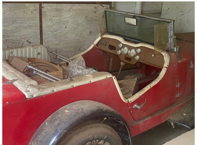
Lance with VW engine

Call Vern at (925) 954-2866 or text (925) 378-8180