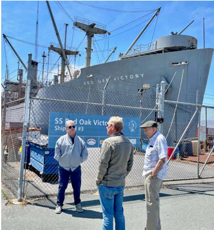
Rights Movement and Women's Movement during the following decades. During World War II six million women entered the workforce."Rosie the Riveter" and her "We Can Do It" motto came to symbolize all women Home Front workers.