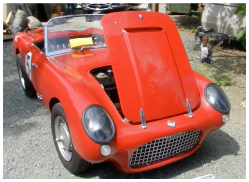
Shown below: The Studemino using fiberglass kit from Florida and based on a 1980 Chevy El Camino.

Below: The 1958 Berkeley SE 328 powered by an air cooled 2-cylinder engine. (Shown at right)