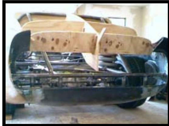
Below: A new fiberglass piece was built from scratch to fill the Kamm-back portion of the rear body work.