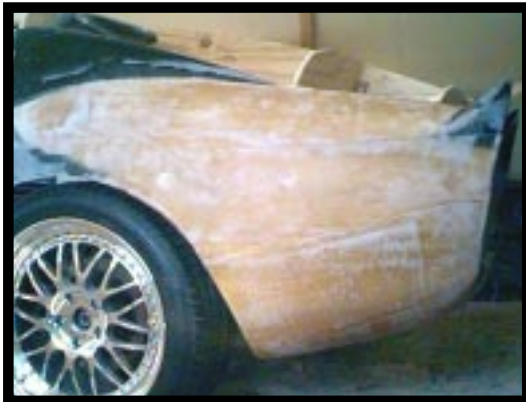
Above: Fiberglass is applied directly over the foam to form a fender of the desired shape.

Urethane foam is easy to cut into strips with a razor knife. Strips were required as I was applying a flat rigid material to a curved surface. A hot melt glue gun works well for gluing the foam to the fiberglass and wood under it. A mixture of 1" and 2" thick strips are used depending on how much fill is needed in the different areas of the fender.