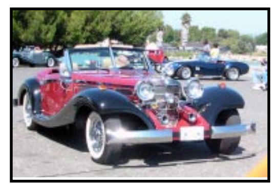
3rd Chuck Maddux - Mercedes 500K