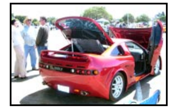
3rd Alan Phllips - Finale