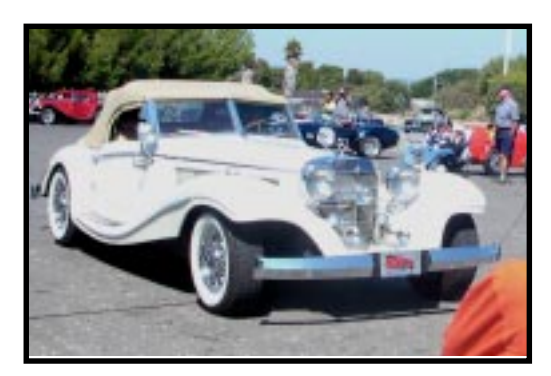
2nd Vern Hance - Mercedes 500K