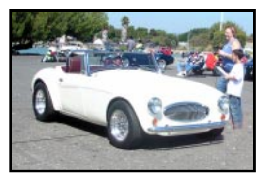
2nd Jim Vermace - Sebring MX