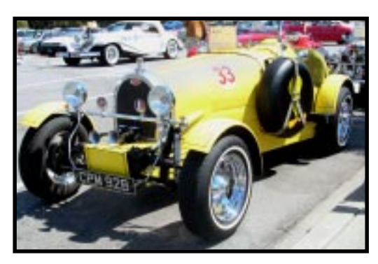
2nd Tom Lugone - Bugatti T-27