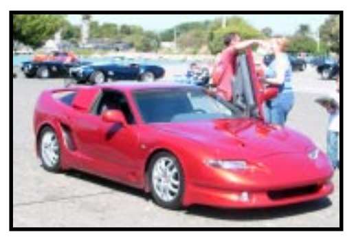
LADIES CHOICE Alan Phllips - Finale